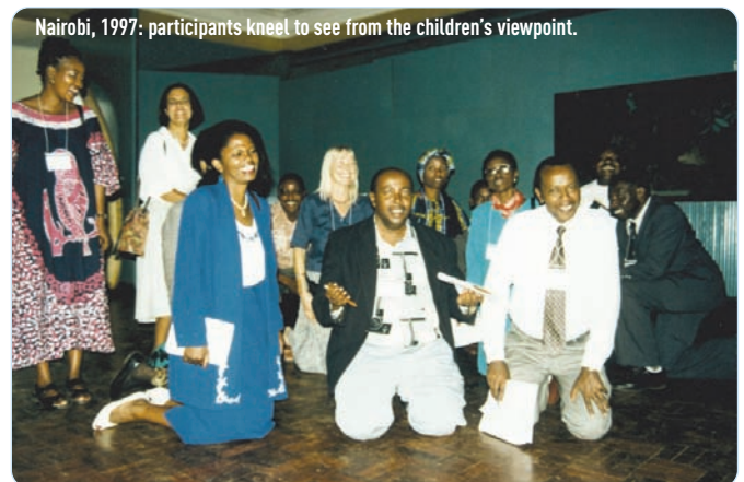
Nairobi, 1997: participants kneel to see from the children's viewpoint.

Workshops have addressed the important subject of Children and Museums in Africa and the Caribbean. Three in Africa have all emphasised that the development of programmes and exhibitions for children, as well as children's corners or museums, should involve consultation with children themselves from the beginning. Not only should children be included but also parents, teachers, caregivers, and elders and holders of the traditions of culture and technology. Children, parents, teachers and others working with children have been included as part of the workshop programme. At the first practical workshop in the Caribbean, held in the Bahamas, similar emphasis was placed on consultation with these groups and here a significant number of educators attended. In addition, the workshop was built into a larger programme commemorating the 200th anniversary of the abolition of the transatlantic slave trade.