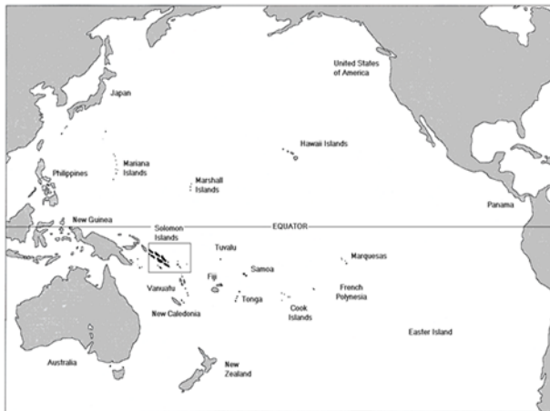
Figure 1. Map of the Pacific showing the Solomon Island. (Adopted from Nunn, 2003)